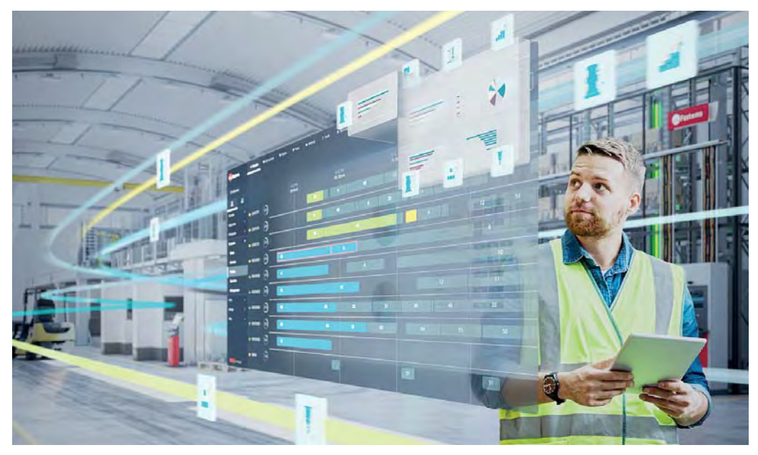
the Spring of 2022. The new MMS Insights module provides CNC

In addition, Fastems has developed the user experience and added functionalities that support an economical use of modular fixtures, allowing a higher production mix with smaller workholding investment. Version 8 will be available to new and as an upgrade to existing Fastems automation systems during